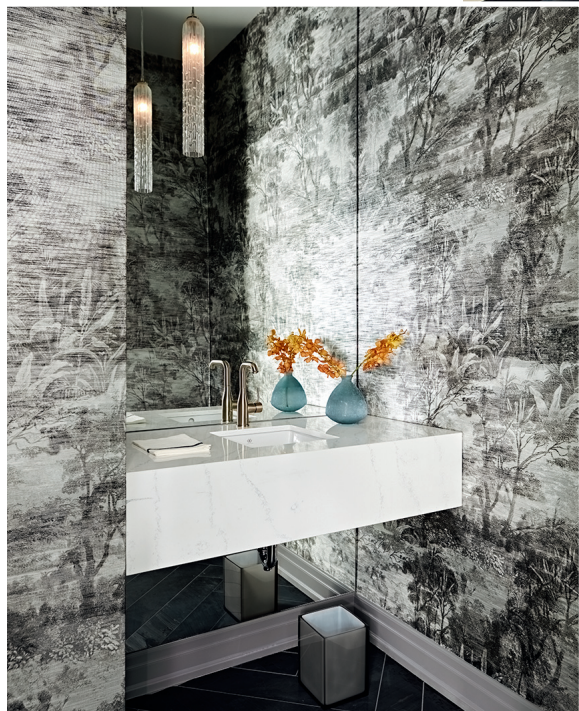
◀ Brian saves statement wallpaper — like this metallic scenic print — for the powder room, along with a mirrored wall and floating vanity. Wallpaper, Arte; countertop, Hanwha Surfaces; faucet, Grohe; light, Universal Lamp.

“YOU HAVE ALL THIS SPACE HERE, WHY NOT USE IT? THERE ARE NO ROOMS ABOVE THE KITCHEN SO I GAVE IT A VAULTED DETAIL AND A SIMPLE PENDANT LIGHT TO DRAW THE EYE UP”