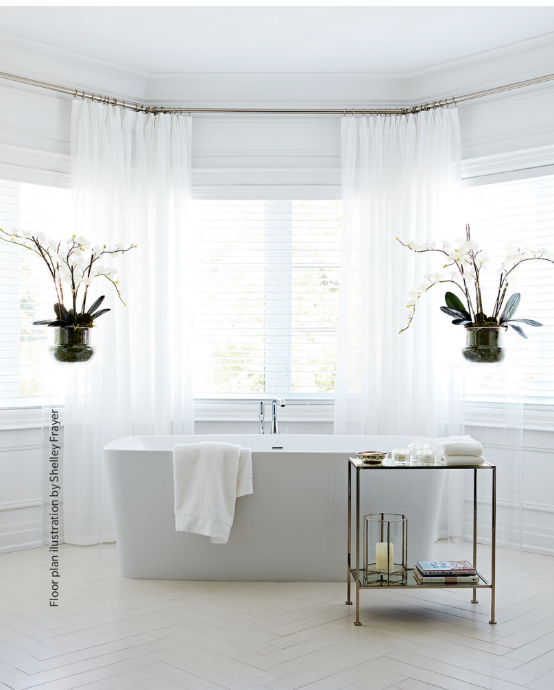
Floor plan illustration by Shelley Frayer

WOW MOMENT: BRASS CANOPY BED “I’VE HAD A FOUR-POSTER BED IN MY OWN HOME FOR 17 YEARS. THIS BED REALLY MAKES A STATEMENT AND MODERN BRASS VERSIONS ARE SUCH A GREAT UPDATE ON CLASSIC WOOD FRAMES”