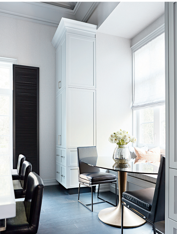
▲ “People have commented on how cosy the house is,” says Brian. “It’s because there are so many comfortable places to sit.” In the kitchen, banquette seating in a bay window (flanked by pantry units) overlooks the backyard patio and pool. Chairs, table, stools, GlucksteinHome; flooring, Vintage Hardwood Flooring; shutter colour, Onyx (2133-10), cabinetry colour, Coventry Grey (HC-169), Benjamin Moore.